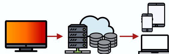
Alphonso Campaign Management System